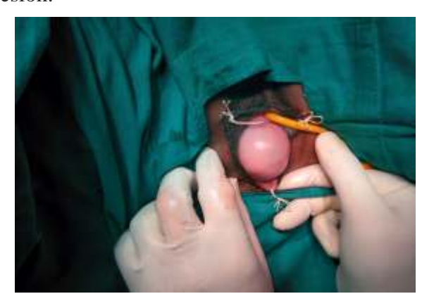
Fig.1: Local Examination showing Posterior Vaginal Wall Cyst

During postoperative follow up period, patient recovered completely with no recurrence of lesion.